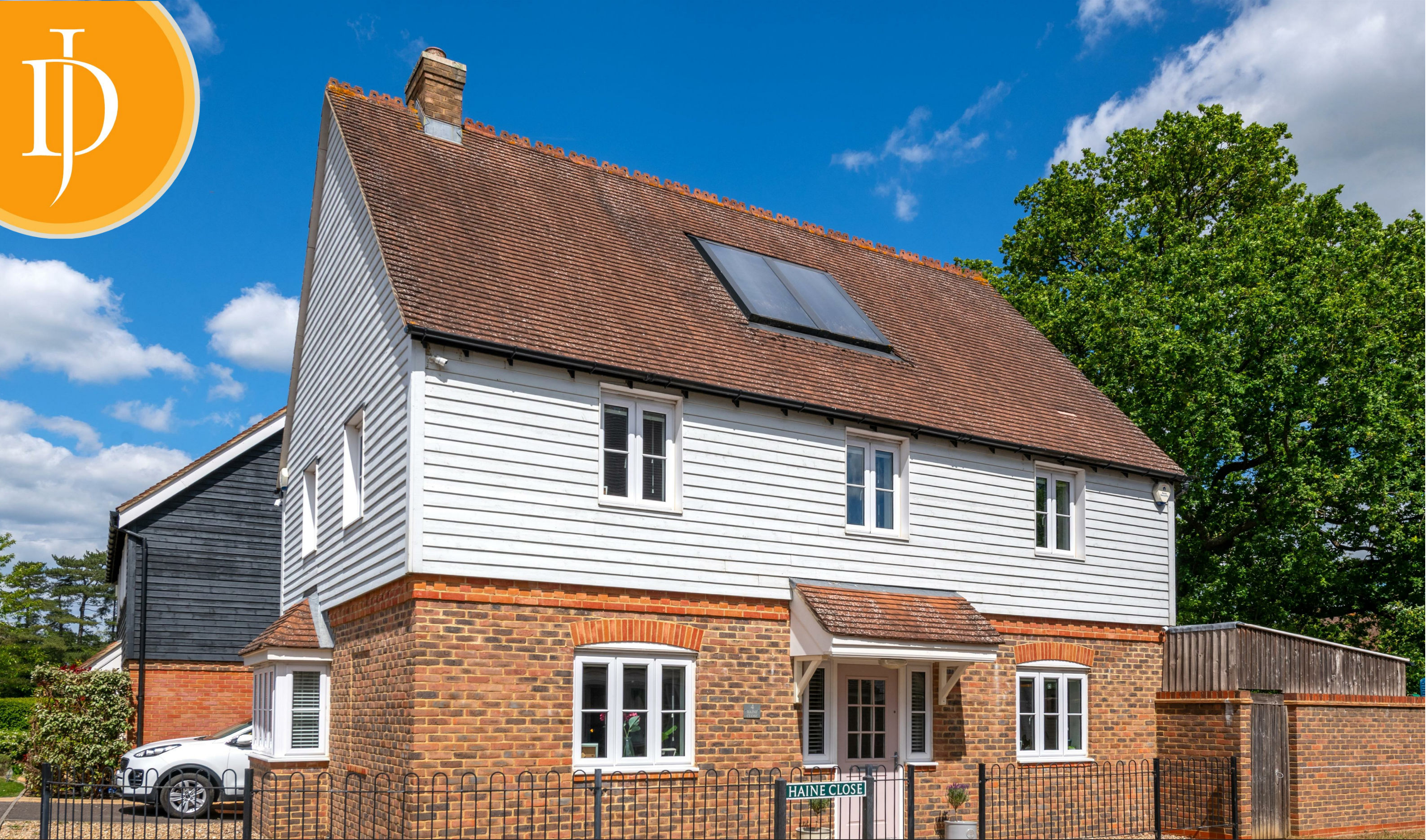
4. Haine Close, Horley, RH6 9SU Offers In Excess Of £700,000